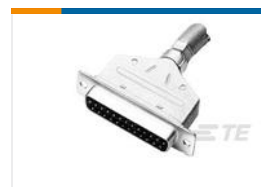
TE Part # 747548-8 KIT, RCPT, 25P, HDE, SHLD HDWRE