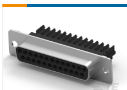
TE Part # CAT-AM7-248H5 IDC D-Sub: Receptacle Assembly, Wire to Wire, Signal, 2.77 mm