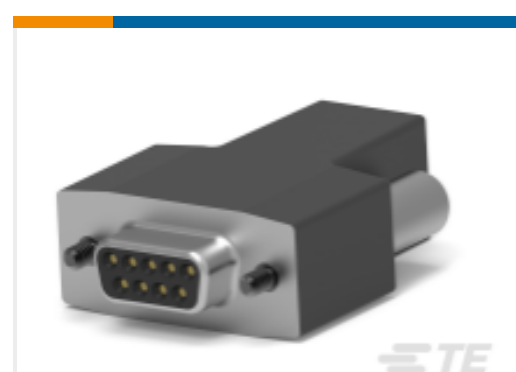
TE Part # CAT-AM7-248H6 IDC D-Sub: Receptacle Kit, Wire to Wire, Signal, 2.74 mm