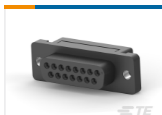
TE Part # CAT-AM7-253 IDC D-Sub: Receptacle Assembly, Low Profile, Signal, 2.77 mm